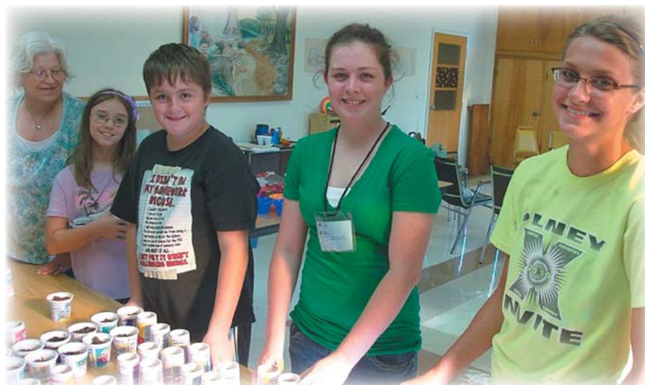
Some of the many volunteers at Vacation Bible School. See Ministry #105.