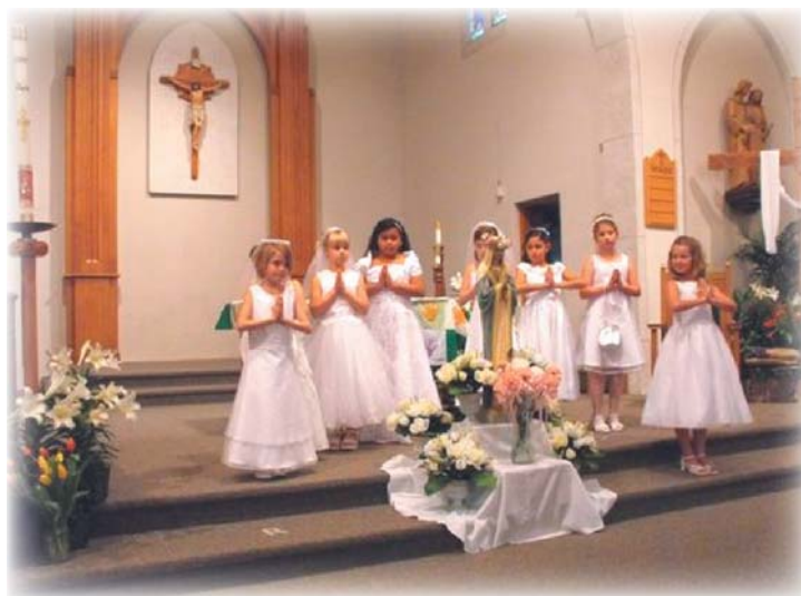
First Communion girls are pictured (left) crowning the Blessed Virgin Mary Statue at the Mother Daughter Banquet, hosted by the Parish and Family Life Committee. See Ministry #305.